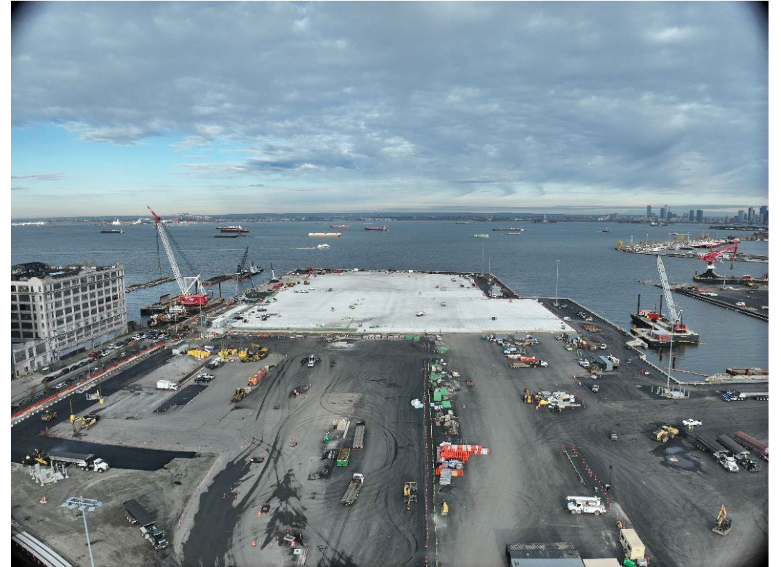
Pier 39 – November 2025