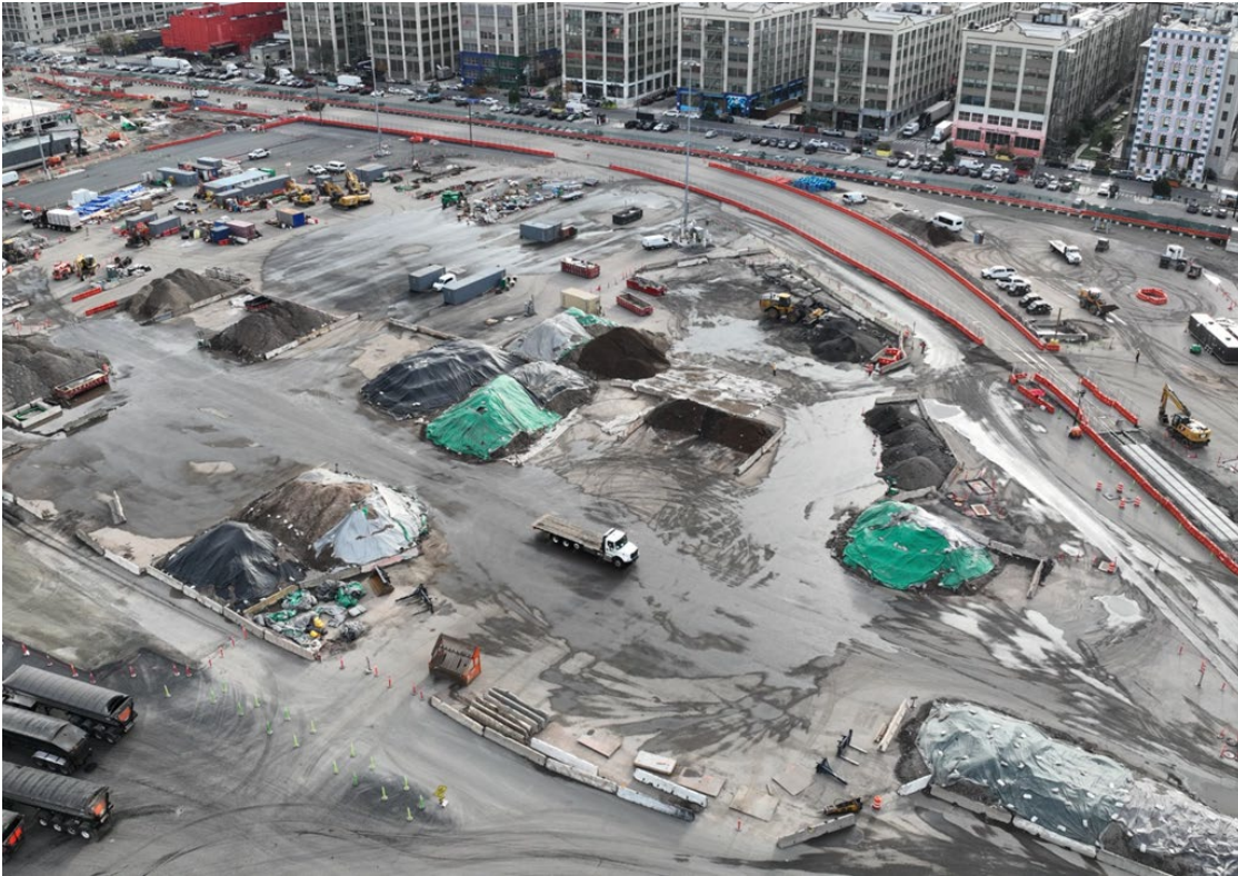
Port Staging Area – November 2025