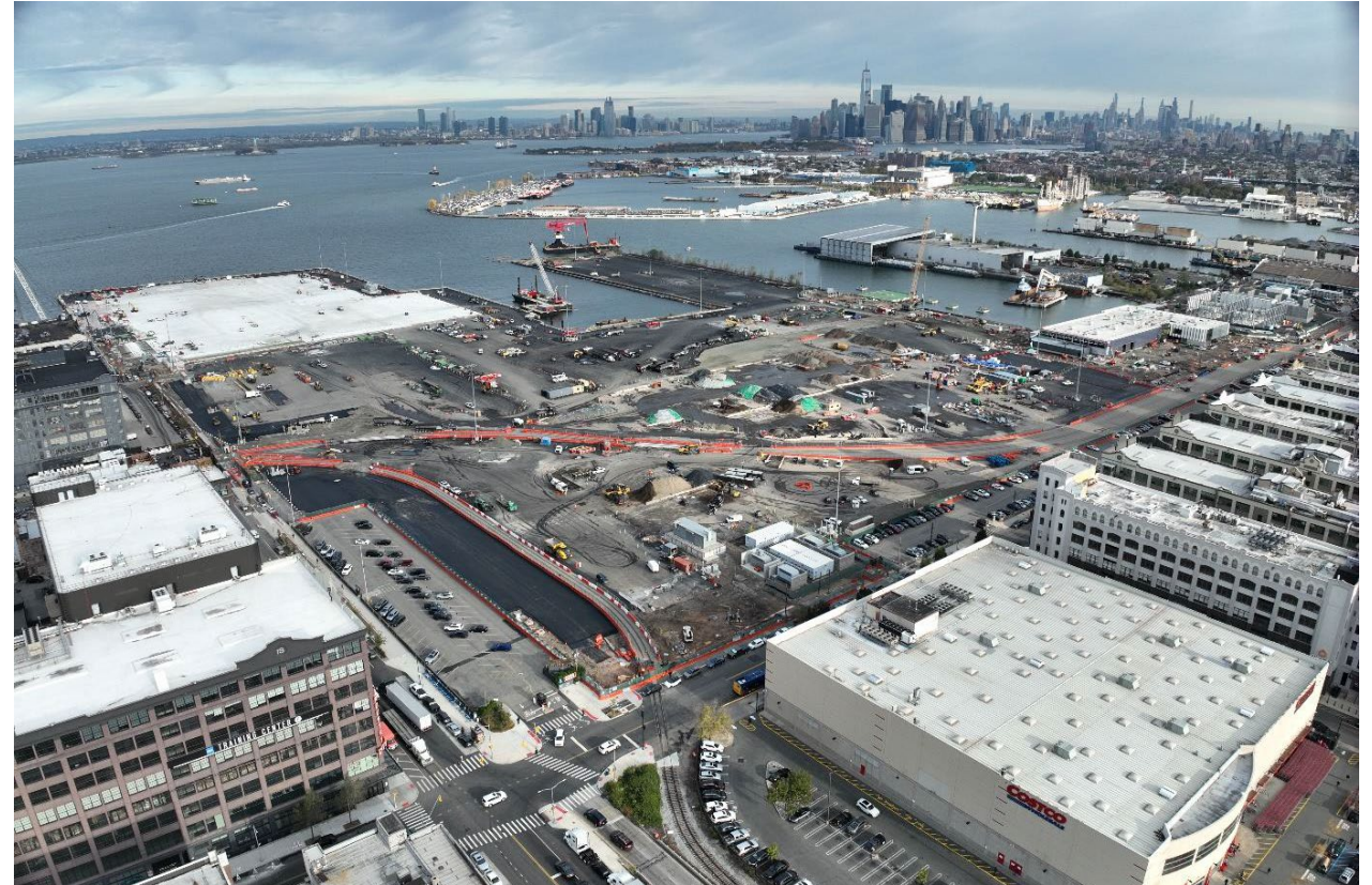
SBMT Sitewide – November 2025