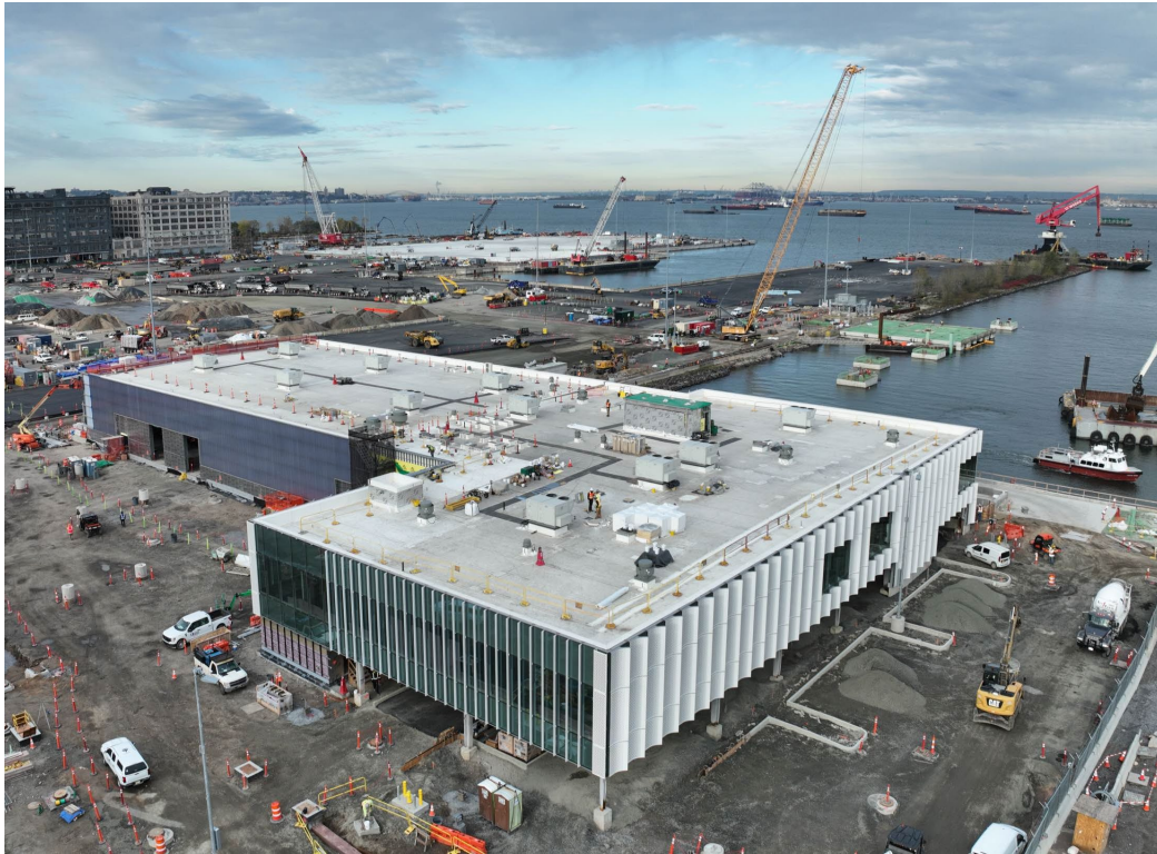
Operations & Maintenance Base – November 2025