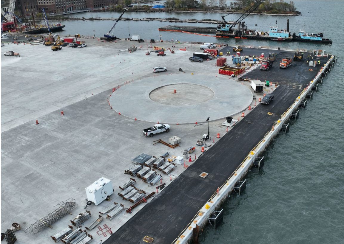
Pier 39W Ring Crane Pad – November 2025