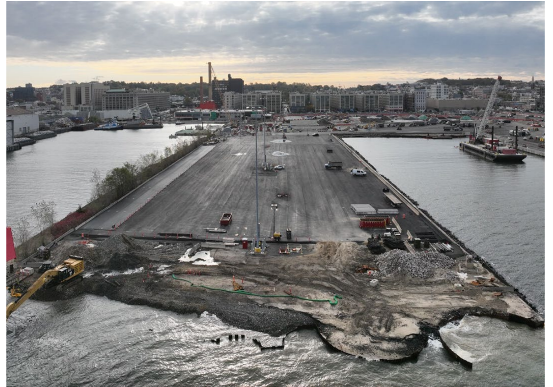
Pier 35 – November 2025