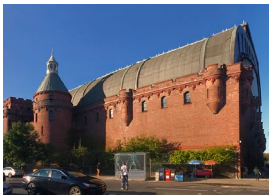
Kingsbridge Armory Bronx Emergency food packaging and delivery hub