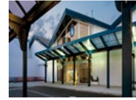
Cruise Terminal Brooklyn Medical facility to serve up to 750 NYC patients - has not yet been activated