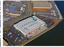
Hunts Point Bronx Supplier trucking facility for central delivery hub