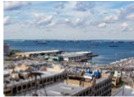
South Brooklyn Marine Terminal Currently being used for emergency purposes