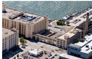
Brooklyn Army Terminal Contemplated COVID19 testing site